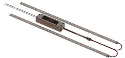
Converts 2 ft. by 2 ft. fixtures

RKS Universal Fluorescent Fixture Retrofit Kit. Easily converts most all your existing residential and commercial 4 and 8-foot T5, T8 and T12 linear fluorescent light fixtures into an integrated LED light fixture. This retrofit kit works with the earliest to the latest versions of ceiling mount, 4-foot and 8-foot fluorescent light fixtures, regardless of the style, manufacturer or existing ballast type including linear highbay, strip or wrap fixtures and even chain suspended shop lights.